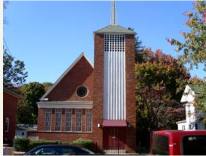
Our Lady of Sorrows—Wallingford, CT